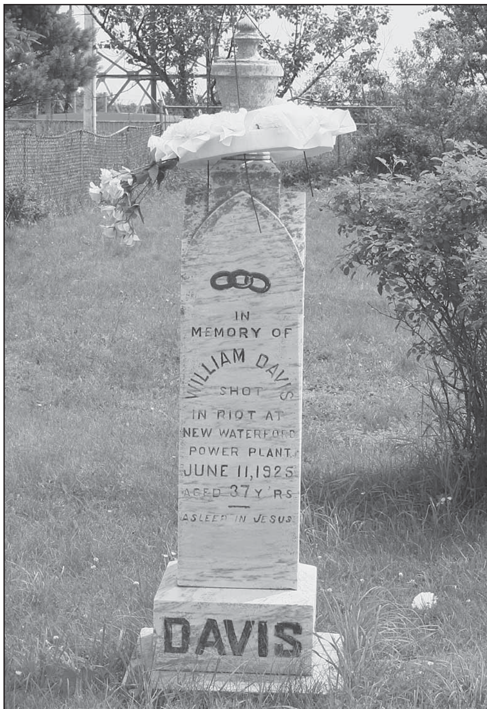
Figure 4: William Davis grave, Scotchtown.