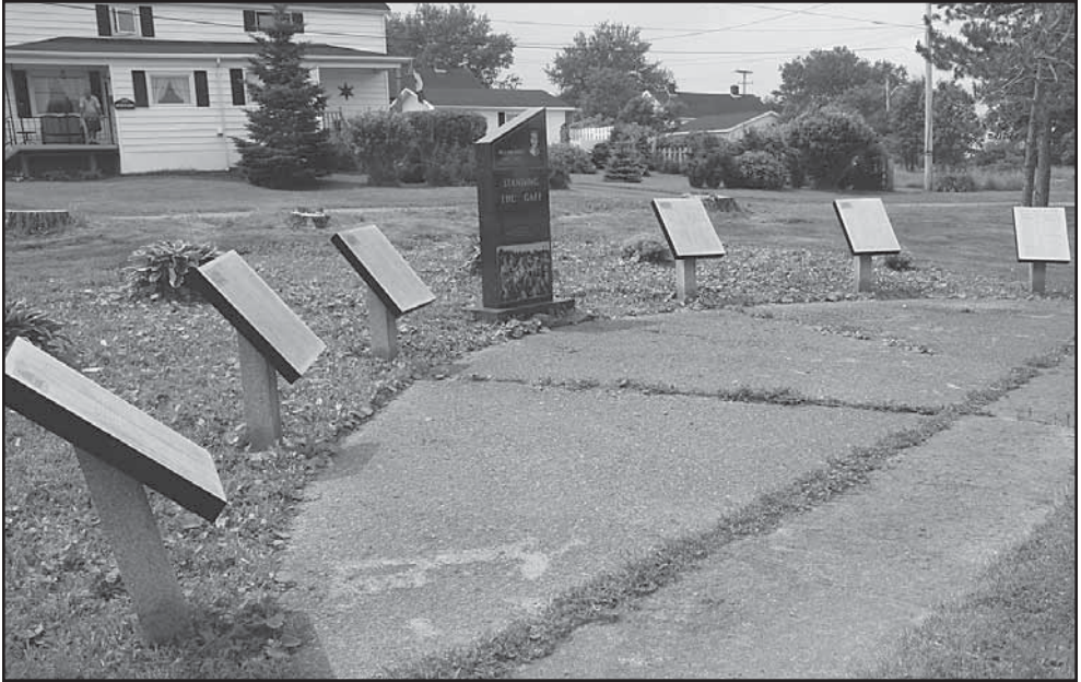
Figure 3: William Davis Monument and historical panels.