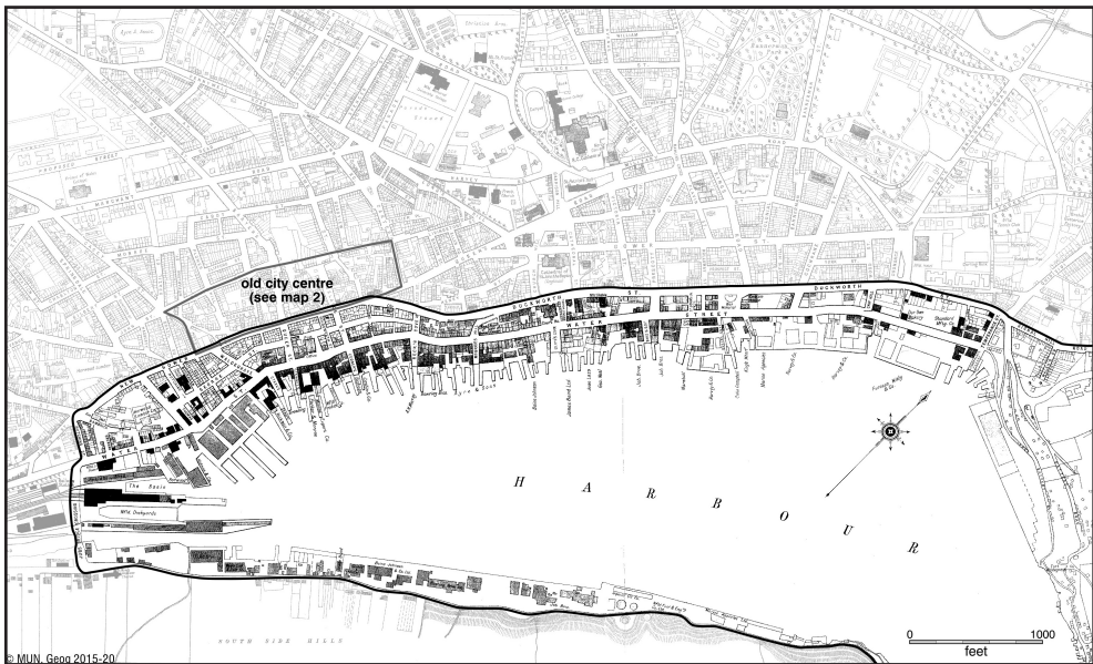
Map 1 – City of St. John's (1932) Depicting the Location of the "Old City Centre"