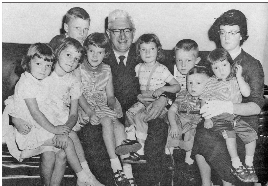
Figure 3 – Mayor Nathan Phillips with the Kingston Family in Toronto.