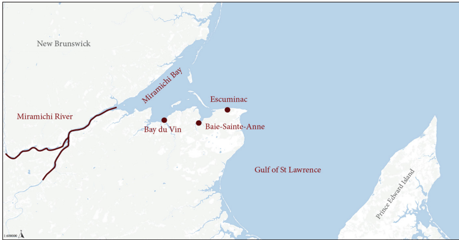
Map 1 – Miramichi Bay, New Brunswick.