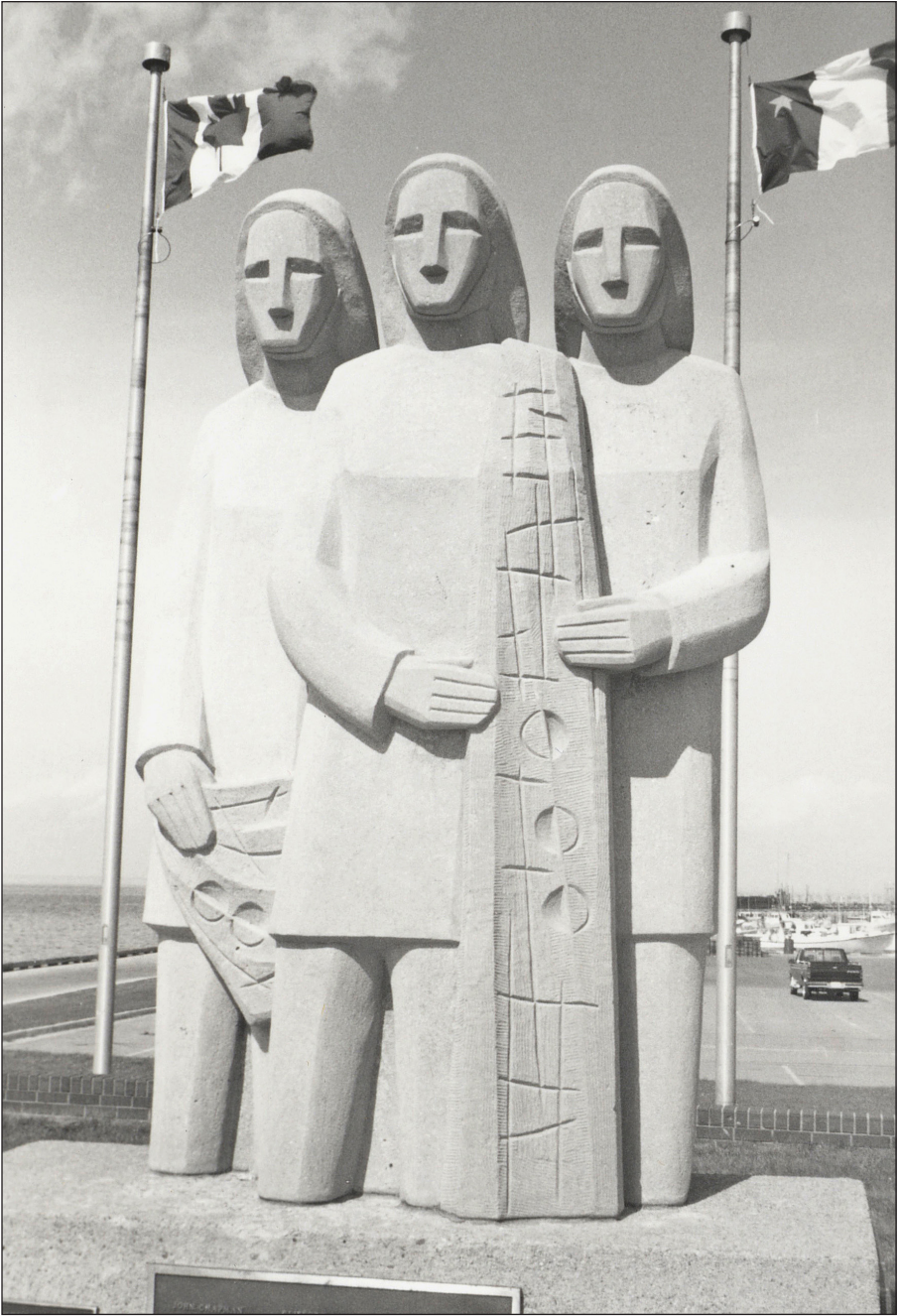
Figure 1 – Fishermen's Memorial, Escuminac, NB – Sculpture by Claude Roussel.