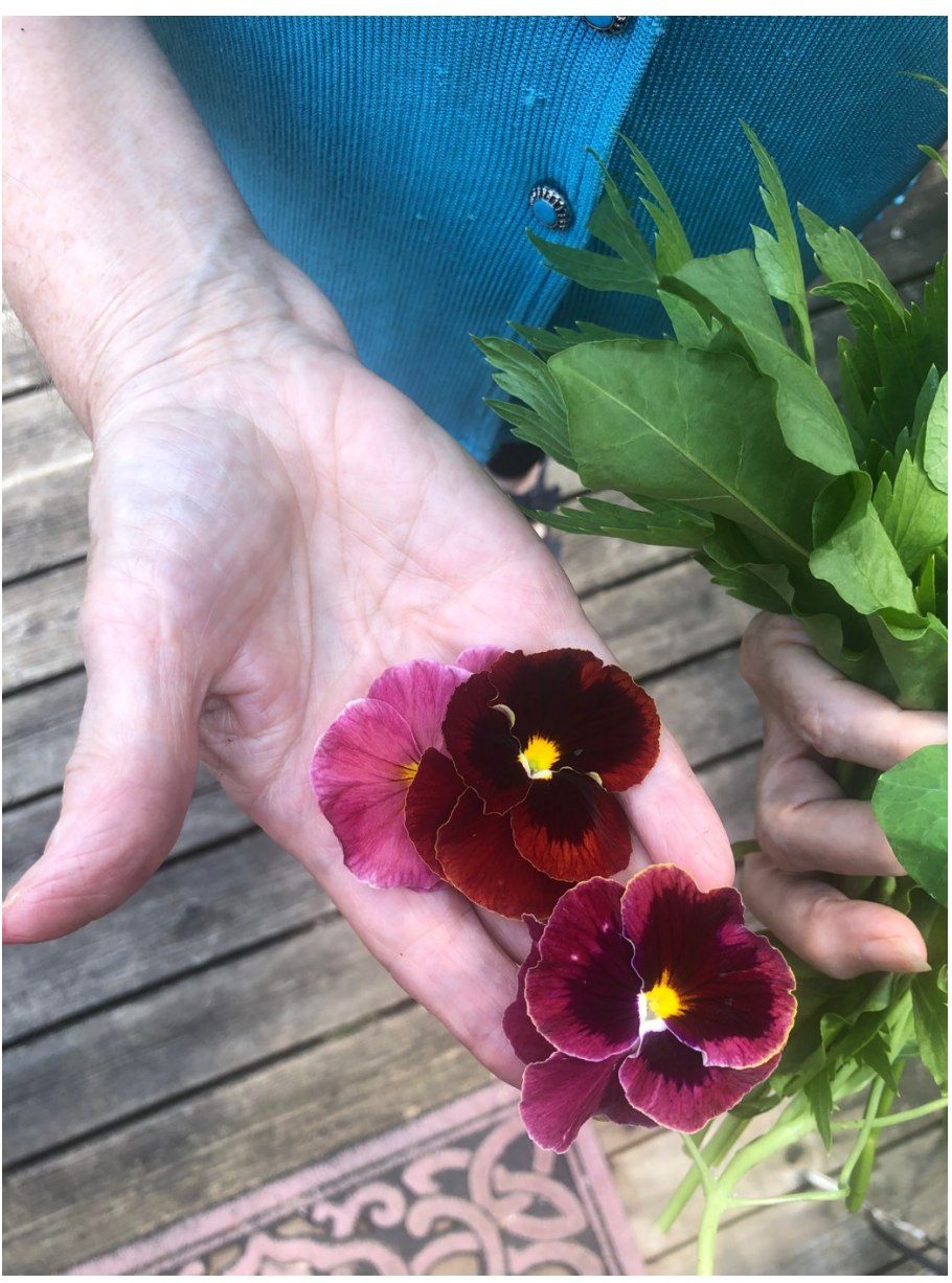
Figure 2 : My mother holds out her hand / An offering of edible flowers and gathering of fresh vegetables from the garden.

Your grannie has been sick for some time now. First with multiple chemical sensitivities - an illness in which her body is overwhelmed by the toxins in our everyday environment. And now with cancer. I have learned from her that the health of the planet and the health of our bodies are intrinsically linked. Before you arrived, she started planting. Planting everything she could get her hands on. Her garden is each crevice of earth she can find in Toronto. She grows food and community with her gardens. She nurtures plants and life in a time of ecological decay. Planting is healing (Figure 2).