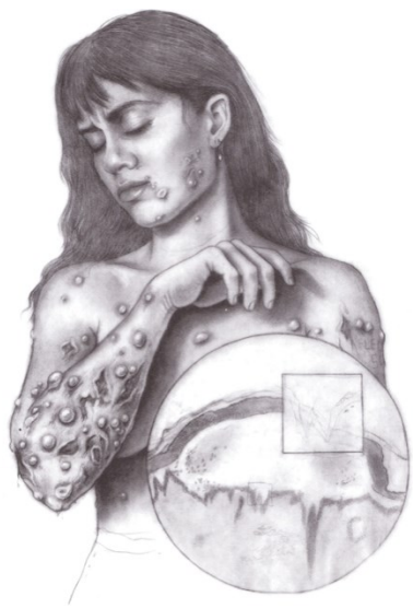
“Self-Portrait with Pemphigus Vulgaris”, 6. ©Gloeckner

follow (Michael). In the second picture, the cover of the experimental novel “The Atrocity Exhibition”, Gloeckner’s professional background as medical illustrator becomes very apparent. Again, the figure shows parallels to herself. Beyond that, however, it also shows clear parallels to Vesalius’ musculen. The body is slit, stripped to the muscles and the skeleton and stands in a landscape that is proportionally too small. Unlike the musculen, however, the figure is depicted in an urban setting and not as a whole. Compared to drawing one and the musculen, it does not appear to be suffering, but has a proud posture. Gloeckner’s drawings very often have this anatomically exact and scientifically descriptive character.