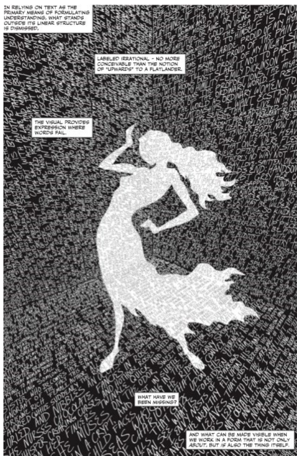
Sousanis 59 ©Sousanis