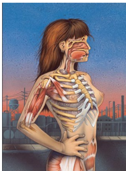
Cover illustration for Ballard, J. G.

The deformation and transformation of the body also play an important role in scientific comics. For example, McCloud, in his metacomic “Understanding Comics”, opts for an autobiographical narrative by constantly bringing his body into the picture. In this way, his book is far more strongly tied to his body (not his person) than is usually the case. The reader constantly has a physical impression of him whereas other scientific publications neglect this dimension.