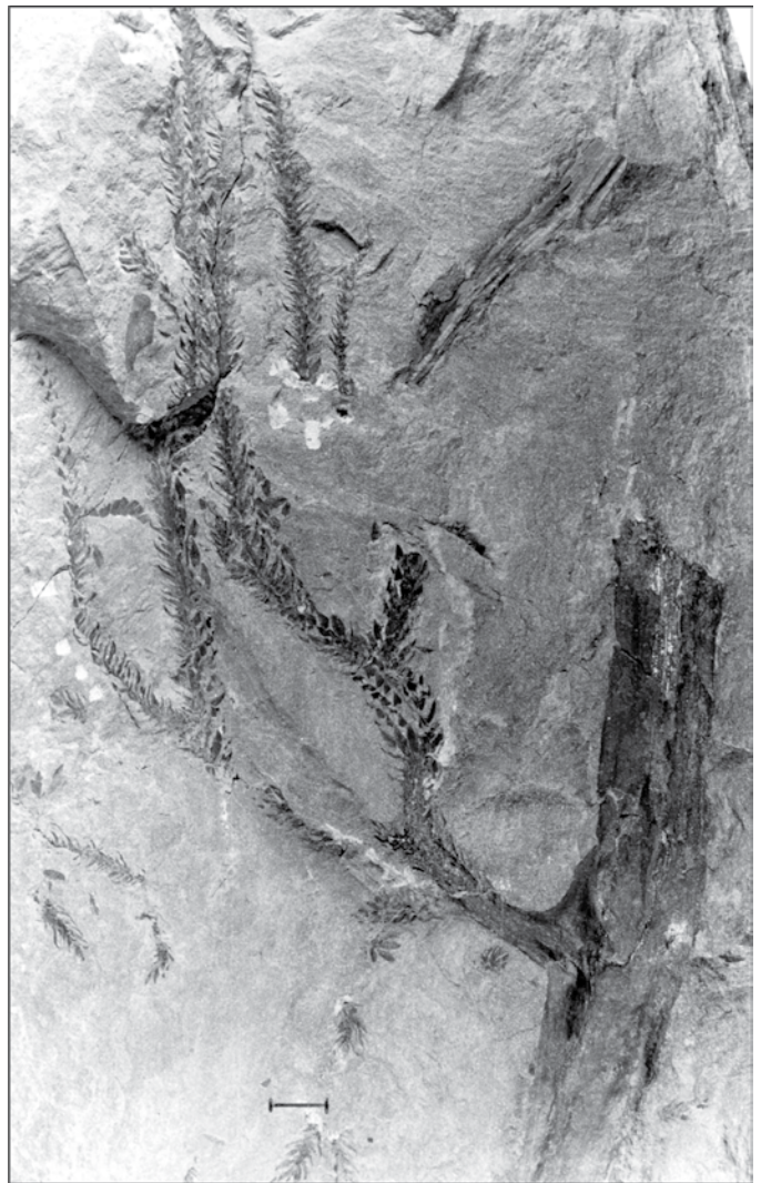
Fig. 1. Bothrodendron punctatum (Nova Scotia Museum, no. 990-281) from the Coal Measures (above the O'Dell/Gardiner Seam from the Pioneer Coal Mine at Sydney Airport) of Nova Scotia, Canada. Scale bar 10 mm.

Lindley and Hutton (1833) first described Bothrodendron punctatum from two specimens, one from the roof of the High Main Seam (Duckmantian Substage) of Jarrow Colliery in County Durham and the other from the Percy Main Colliery, Newcastle-upon-Tyne. The former specimen was figured by Lindley and Hutton (1833, pl. LXXX) and Crookall (1964, pl. LXXIII, fig. 5) and is now in the collections of the British Geological Survey (BGS collection no. 5257). The whereabouts of the latter specimen is unknown.