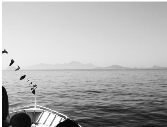
Island of Nisyros (considered volcanically active) viewed south from the Island of Kos; the island is approximately 8 km in diameter.