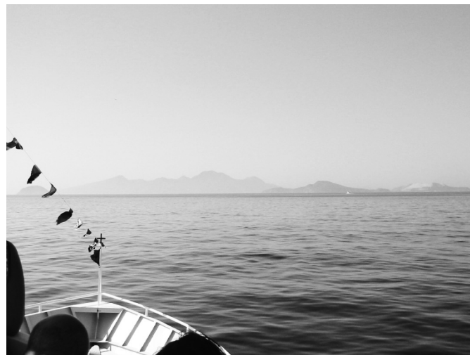
Island of Nisyros (considered volcanically active) viewed south from the Island of Kos; the island is approximately 8 km in diameter.