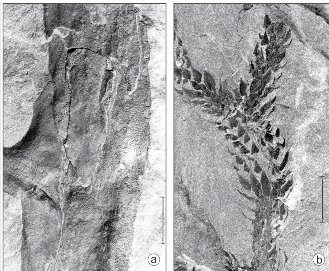
Fig. 2. Bothrodendron punctatum . (a) Area of attachment of the lateral branch and (b) portion of dichotomising leafy shoot. Scale bars 10 mm.

In contrast to Bothrodendron minutifolium , which is relatively widespread in the Pennsylvanian-age macrofloras of Euramerica, Bothrodendron punctatum was much rarer and