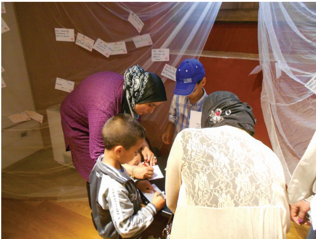
Figure 4. Visitors writing their own welcoming words and stories on cards.