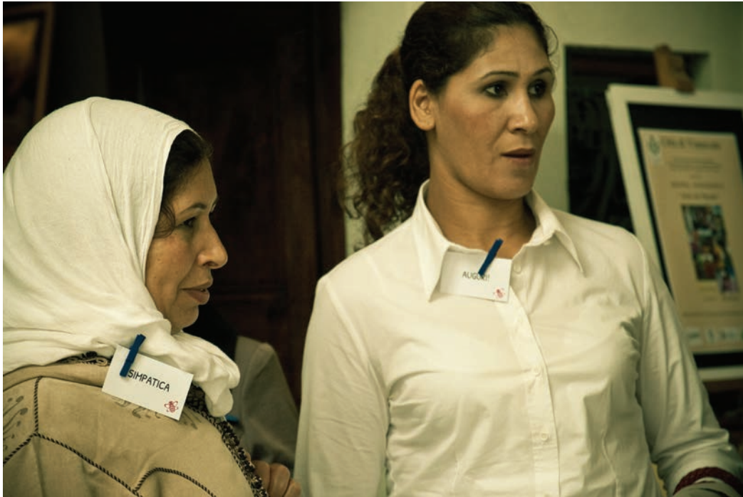
Figure 3. Visitors to the museum wearing the tags with the welcoming words on site.