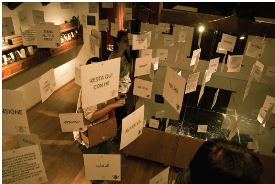
Figure 1. Cards with the collected welcoming and unwelcoming words and stories hanging down from the ceiling at eye level.