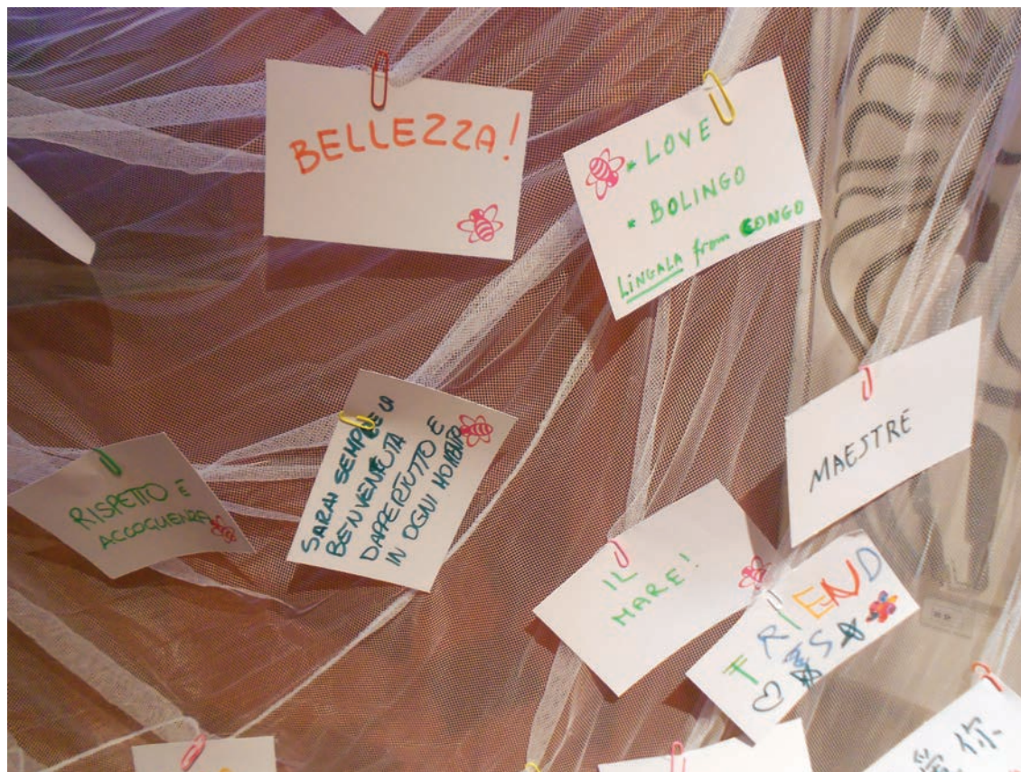
Figure 5. Visitors words and stories on the hanging.

As a researcher interested in local museums and diversity and a volunteer at COI, I coordinated the process from the initial idea for a sight-and-sound installation to the actual exhibition, created by COI's volunteers with the support of MUST. I dealt with the graphic design of the exhibits and with some aspects of the audio-video projection, other volunteers took care of recording and editing the video interviews, and so forth.