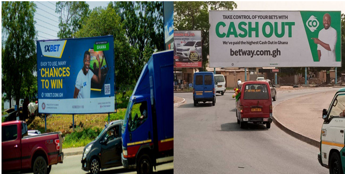
Figure 1. Two examples of betting billboards on the streets of Accra.