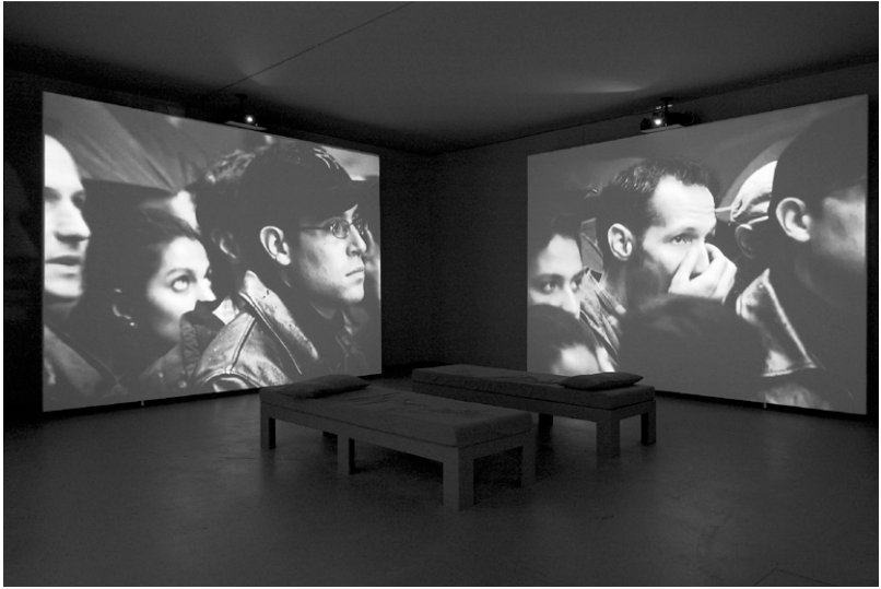
Broadway , Craigie Horsfield, © 2006. Courtesy of the artist.

in itself a temporality leading to an awareness of historical time, can in fact be (as is the case here) an exploration of presentness as a condition of the possibility of history.