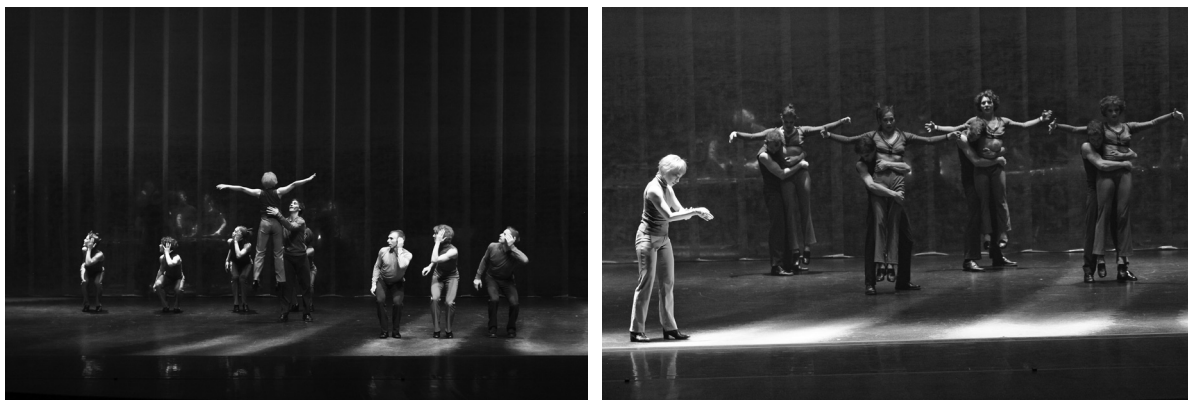
FIGURE 2 La vie qui bat, performance, Salle Pierre-Mercure, Montreal, February 18, 2011

In the choreography of Anne Teresa De Keersmaeker, she and Reich shared the same thinking about composition as process, and she used similar techniques (e.g., repeats and variations on motive) to building a parallel work in dance form. For this article, I did not have a chance to interview De Keersmaeker, so cannot comment on the specific constraints and challenges she might have faced working on the piece.