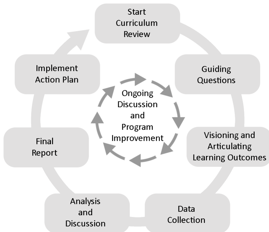
Figure 1: Elements of the curriculum review process for quality assurance (Dyjur, 2016)

Figure 1 provides a framework that identifies elements and processes that occurred as part of the curriculum review process for quality assurance. The outer circle describes the stages of the curriculum review process beginning with establishing the Curriculum Review Team, identifying guiding questions to support the process, visioning and articulating learning outcomes, identifying data sources and engaging in data collection, analyzing the findings and discussion of significances in relation to the guiding questions, writing a final report, and implementing the action plan. The inner circle captures the iterative and continuous nature of how ongoing discussion leads to program improvement through the evidence-driven process.