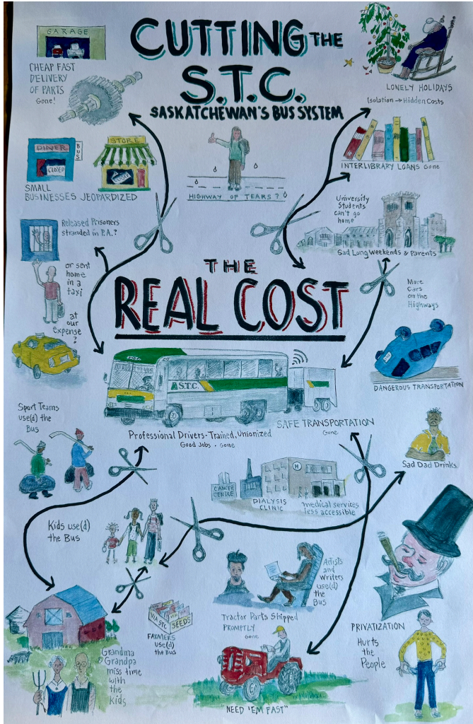
Figure 3. Poster created by Jan Norris for Save STC

Note. The poster was created through a participatory workshop facilitated by the author (Cindy). The intention was to discuss and document the different ways people's lives would be impacted without the publicly owned bus service.