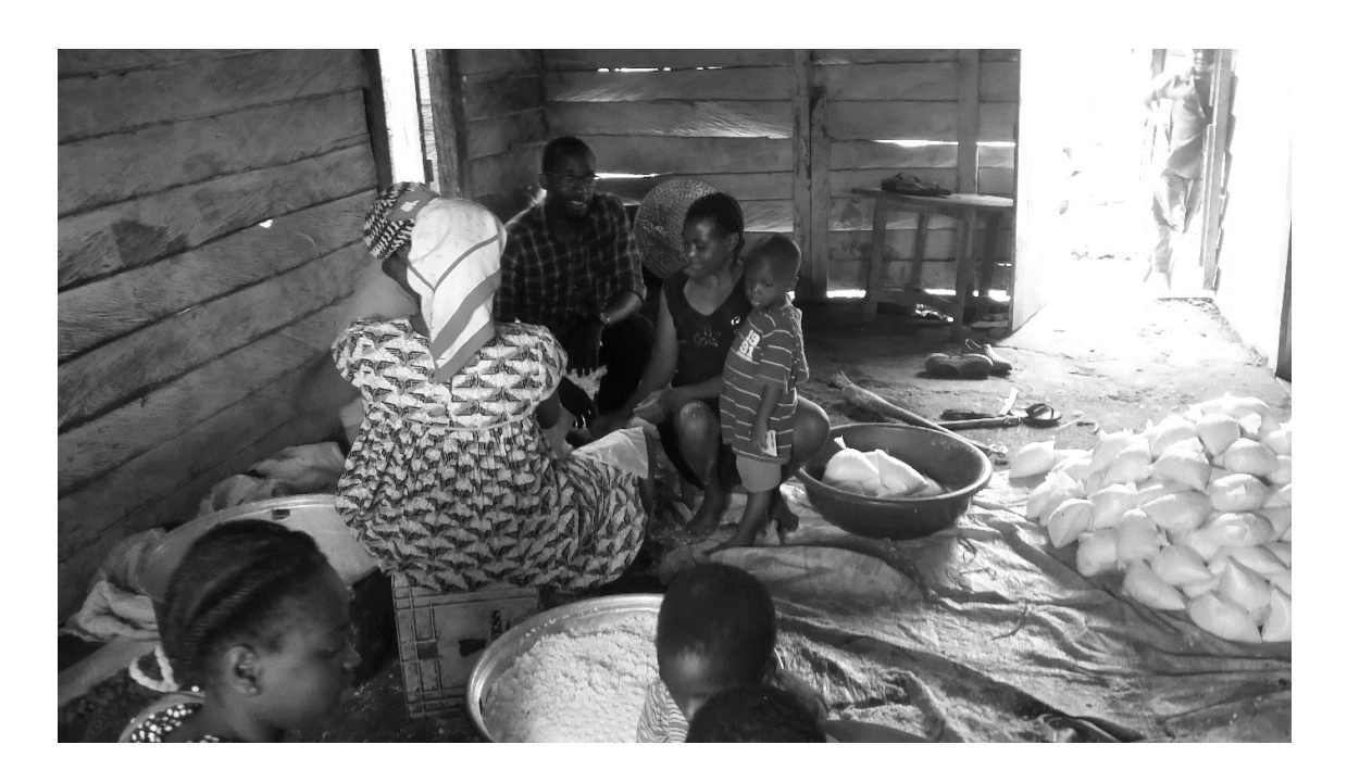
Figure 2: Meeting with farmers at Boviongo. The authors' field data gathered in 2017.