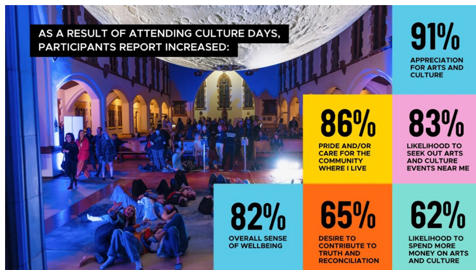
Figure 2: Culture Days Participation Data

While I was paired with the national branch of the organization, each region of the country had a dedicated team to serve their communities. Culture Days Ontario, for example, develops cultural guides specific to towns and cities in that province ( Ontario Culture Days, 2024 ). As a registered charity, Culture Days releases a public report following each iteration of the festival with statistics on the events' impacts on participants (figure 2).