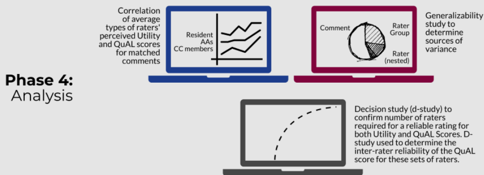
Figure 1. An infographic depicting our study protocol phases and steps

We completed three different analyses with our collected ratings of the comments.