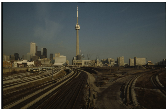
Figure 1. Infrastructural abandonment before the development in CityPlace. A view looking east across the western Railway Lands to the SkyDome under construction in the late 1980s.

Construction of the CityPlace neighbourhood spans over two decades, which chapters 5 to 10 recount meticulously, block by block, by juxtaposing narrated event sequences of the planning process in a neat and unobtrusive writing style along with critical descriptions of the buildings and public spaces in between. Indeed, their voices are more manifest in these design assessment walkthroughs, which are