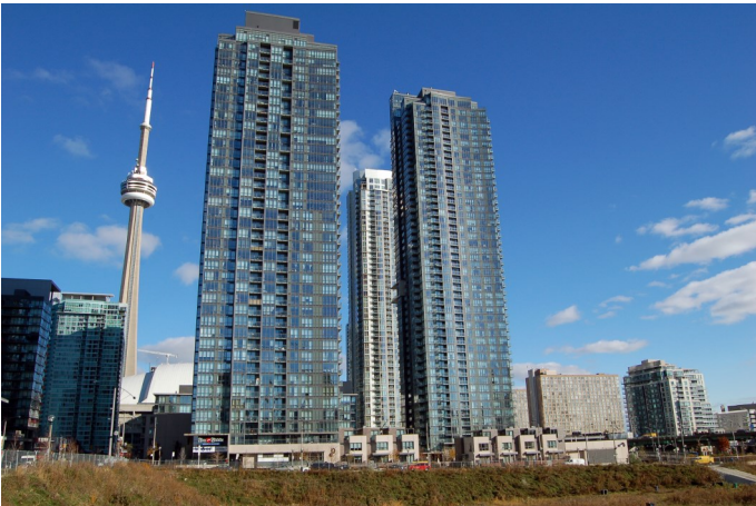
Figure 2. Poorly resolved “Vancouverism” tower-podium typology on Block 25 at CityPlace. A view of N1/N2 tower (left) and the short row of townhouses alongside. The townhouses have an awkward relationship with the N1/N2 tower that make the townhouses seem like a diminutive afterthought rather than part of a coherent urban composition. This view is now obscured by Canoe Landing Campus, developed in the late 2010s before completion of the campus.

a “made in Toronto” condominium megastructure (p. 184). Somewhat tangentially, chapter 8 is a lesson in how affordable housing and public amenities failed to keep pace with creeping height and density concessions made to property developers: while the number of residential units witnessed a “173 percent increase” (p. 207) since the original 1994 plan, the number of affordable units saw a 50 percent reduction. The amount of parkland was also not adjusted to such levels of residential intensification, nor was the street grid. Ultimately, readers are brought to understand that through the passage of time, the gyration of political priorities and iterative concessions, developers – when sustained by a long housing boom – retained the upper hand while planners were left to work reactively, thus obscuring the coherence of the initially-approved public sector plan. Finally, chapters 9 and 10 engage with challenges related to the timely delivery of neighbourhood amenities such as schools, as well as how new residents began to influence certain