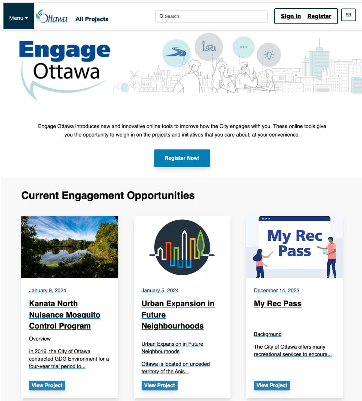
Figure 1. Screenshot of “Engage Ottawa” Dedicated Digital Engagement Platform Built Using EngagementHQ

regional governments across Canada serving populations over 5,000 (local municipalities are the cities, towns, villages, townships, rural municipalities, or other types of local government entities; regional municipalities, where they exist, are groupings of