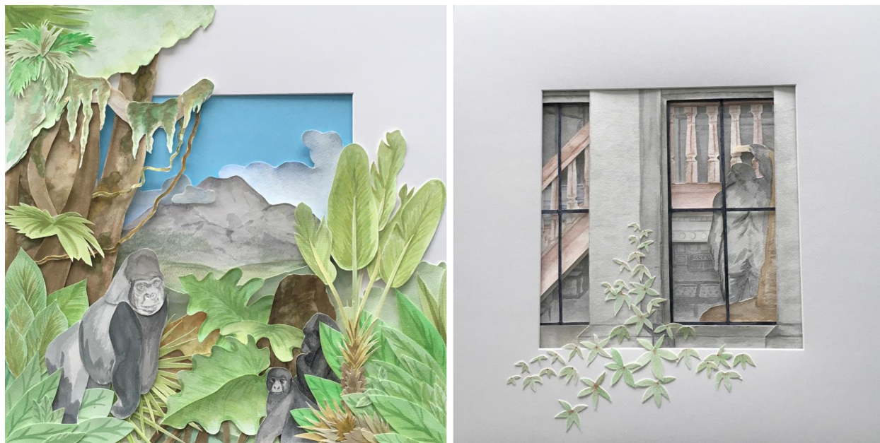
Gorilla Collage 1 [left panel] and Gorilla Collage 2 [right panel]