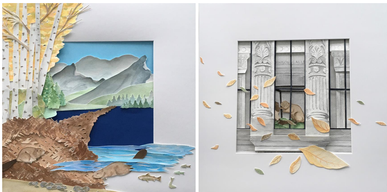
Beaver Collage 1 [left panel] and Beaver Collage 2 [right panel]