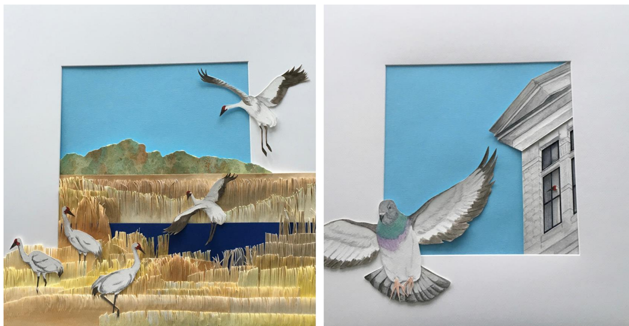
Crane Collage 1 [left panel] and Crane Collage 2 [right panel]

My first whooping crane collage depicts a flock of cranes situated in a prairie/wetland landscape (see Figure 8). Tall grasses in tones of yellows, gold and browns predominate the