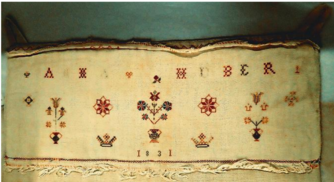
“Zeitfaltung • Time Folding • Folding Time” (17:07)

to consider to think over to remember to recall