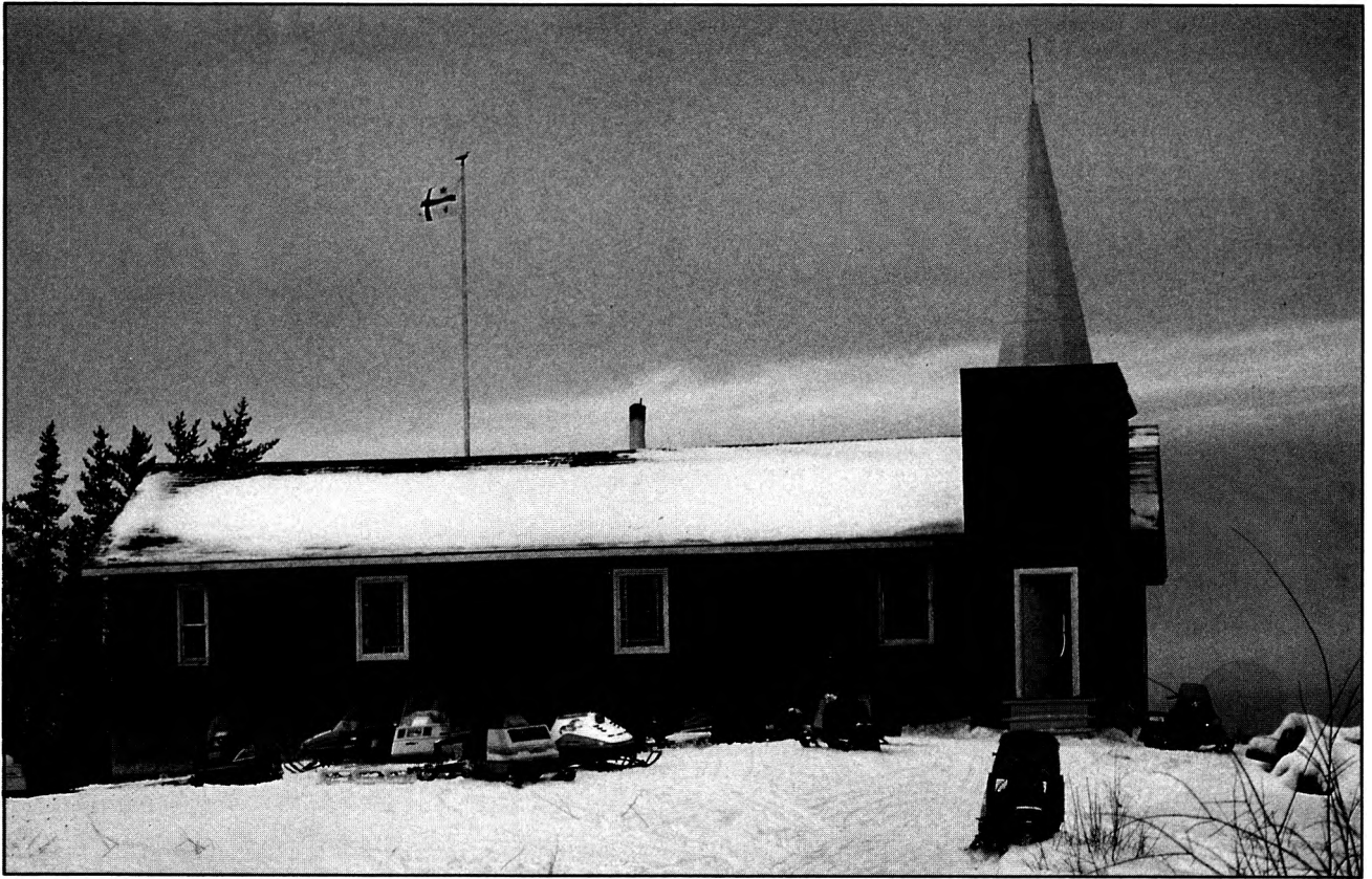
Fig. 2. St. Paul's Church, Lynx Lake, Ontario.

from the local clergy, and those who are allowed to work in the community, for an hour or for a period of months, only do so with the understanding that their concerns are secondary to that of the St. Paul's Anglican church in Lynx Lake. This aggressively self-deterministic attitude is reflected in social, political and economic realms as well. Indeed, as indicated earlier, these institutions are intimately connected with the Lynx Lake church, rendering a division between sacred and secular institutions insignificant.