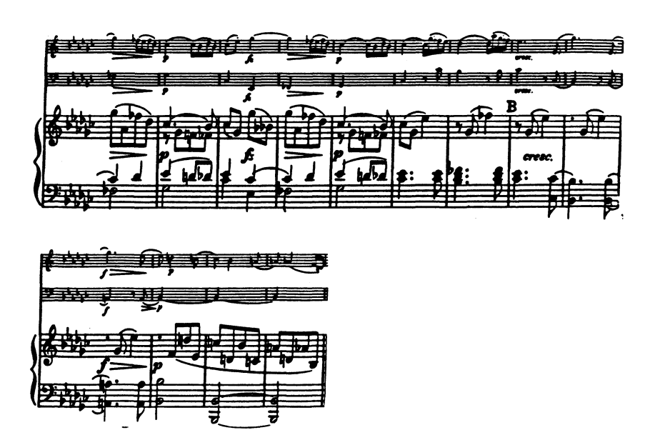
Figure 9. : Haydn, Piano Trio Hob. XV:29, I, mm. 51-79.

In XV:25 there are two themes in G major and g minor respectively. One of the variations of the second theme is in the key of the submediant, e minor, a remarkable departure from Haydn's usual practice of at least beginning each variation in the key of the tonic. In this way the key of the major submediant, E, in the second movement is prepared.