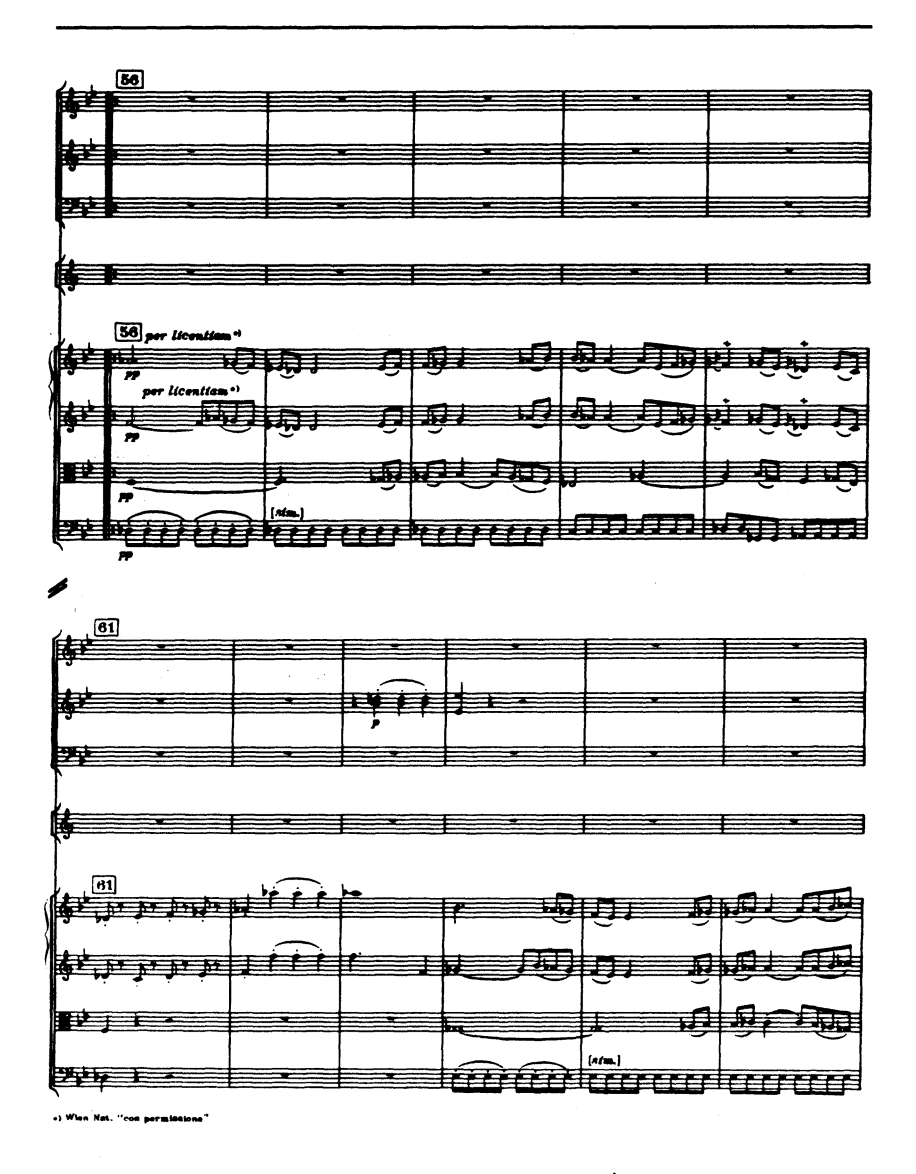
Figure 3.: Haydn. Symphony No. 71 in Bb, IV, mm. 56-66.