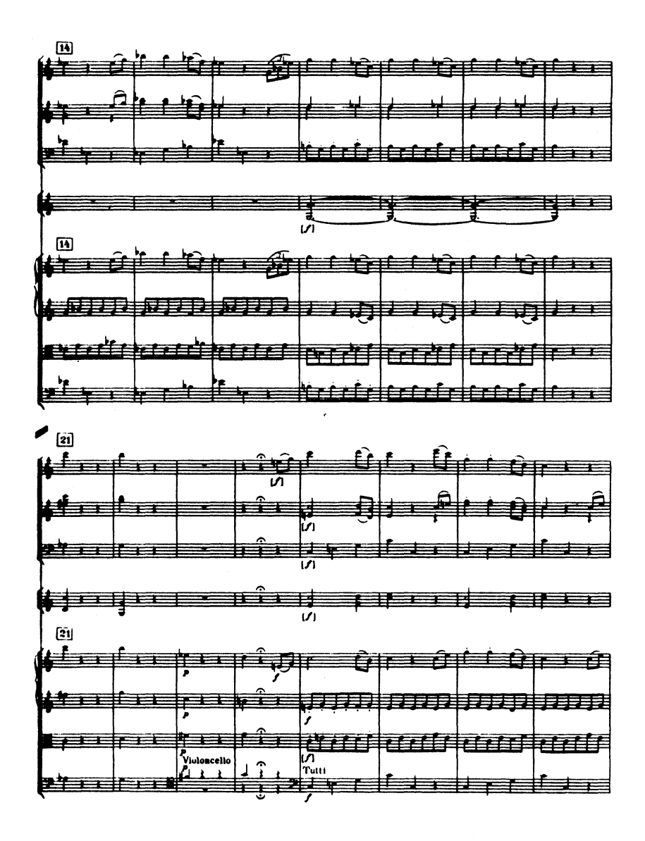
Figure 5. : Haydn, Symphony No. 78 in c, III, mm. 1-28.