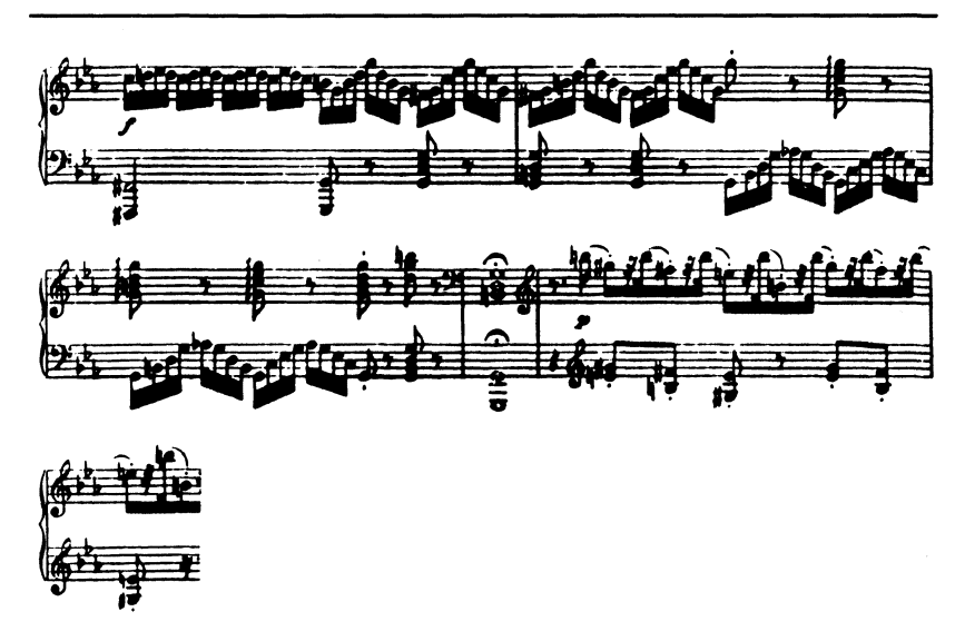
Figure 10.: Haydn, Piano Sonata in Eb, Hob. XVI/52, I, mm. 65-70

The quartet Op.74 No.3 illustrates a point made above: that Haydn's usual practice is to confine tonal relationships to keys in which a common tone exists between the tonic of the first key and the tonic of the second key. There are exceptions to this general rule, however. In the well-known piano sonata Hob.XVI:52 the three movements are in the keys of Eb, E, and Eb. Even this most unusual key relationship can be explained as a form of modal interchange if one keeps in mind Haydn's tendency to offer "explanations" for unusual key relationships. In this case the explanation comes in the first movement near the end of the development section (Figure 10).