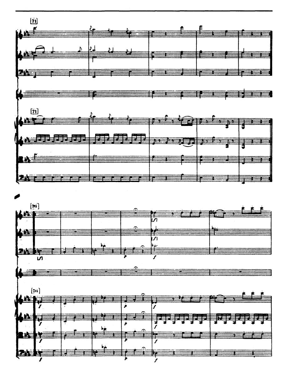
Figure 4. : Haydn, Symphony No. 78 in c, I, mm. 71-81.