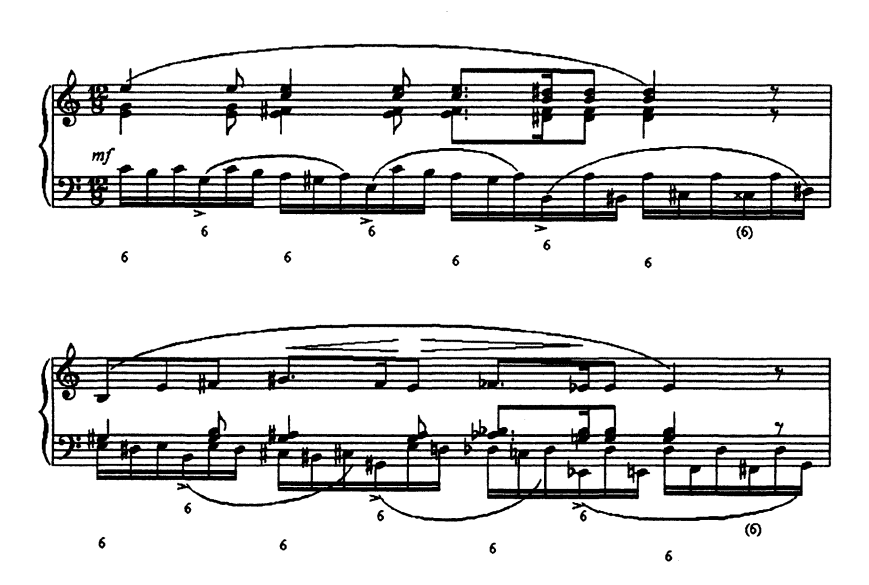
Example 1. Fantasy Pieces, example 2.1: a visual explanation of metrical dissonance occurring in Schumann's Intermezzo, op. 4 no. 4, bars 8–9. From Fantasy Pieces: Metrical Dissonance in the Music of Robert Schumann, by Harold Krebs. © 1999 by Harold Krebs and published by Oxford University Press, Inc.

Florestan said, "I am suddenly seized by an irresistible urge to order a slice of Torte ." He beckoned to a waiter ...<sup>6</sup>