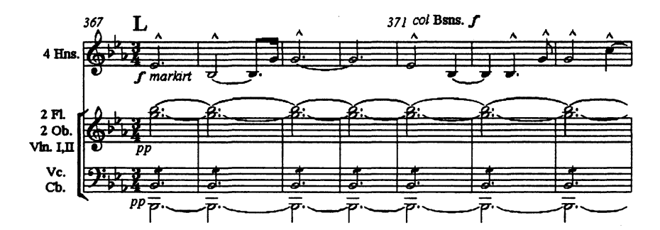
Example 4. Climax of the development section of Schumann's Symphony No. 3, first movement (present author's score reduction), beginning with the generating form of the heroic theme in bars 367–70.

[The retransition] begins with a magical moment; against a static background of tremolos and sustained notes, the horns portentously present a metrically consonant version of the opening theme (bars 367-70). From this form, there emerges the usual subliminally dissonant "duple" version of the theme, which now sounds like a distortion of the consonant form (bars 371-73).]<sup>86</sup>