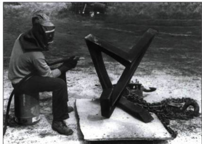
© Claude Millette. L'artiste et Trajectoire n°1 , 1980 (sculpture en cours de réalisation). Collection de Pierre-Paul Sylvestre

Claude Millette | 20.05.2006 – 02.07.2006_ La résistance des matériaux Sélection d'œuvres, de 1976 à 2006 Commissaire : Mélanie Boucher Vernissage 20 mai – 15 h Conférence 31 mai – 19 h