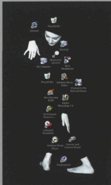
Shadi Ghadirian, ctrl+alt+delete , 2006, C-print, Courtesy of Cicero Galerie (Berlin).

"The headscarf worn in public by Iranian women should not be understood as a separation device," argued the German-based Iran scholar Katajun Amirpur during a panel discussion at Cicero Galerie, nor is the chador a symbol of oppression. This black dress, worn by the dancer in Shadi Ghadirian's eight digital photos ctrl+alt+delete (2006), is delightfully adorned with computer screen icons. The icons change in each photograph,