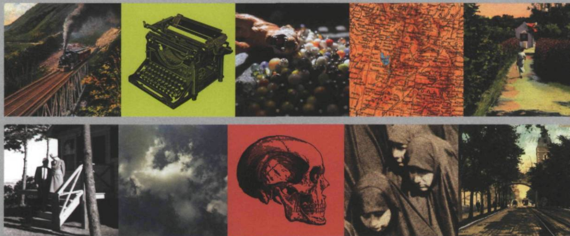
Marques de l'exsangue, polyptyque 1, 2006-2007 Photographie argentique et numérique, impression au jet d'encre, 91,5 cm X 457,5 cm