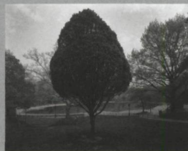
Conservatory Water, Looking North, Central Park, New York, 1994, Canadian Centre for Architecture, Montreal

James's Olmsted photographs represent a seven-year project to create a comprehensive series of images of Frederick Law Olmsted's landscape designs. Credited with the birth of modern landscape architecture, Olmsted is best known for public spaces such as Central Park in New York City and Mont-Royal in Montreal. Conceived to provide respite to the city dweller, his urban