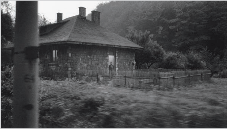
Serge Clément, Maison de Pierre / train Budapest-Istanbul, Hongrie, 2004 , DVD, 12 min.