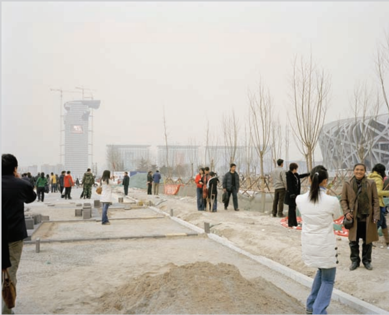
Raymonde April, Équivalences (detail), 2009, c-print, 99 x 123 cm

always evokes something numinous before and after those facts, however quotidian and unprepossessing they seem to be. She tackles a latent semiotic plenum that informs the fabric of a commonly experienced world, whether in family, inhabited spaces, or quirky souvenirs of the everyday.