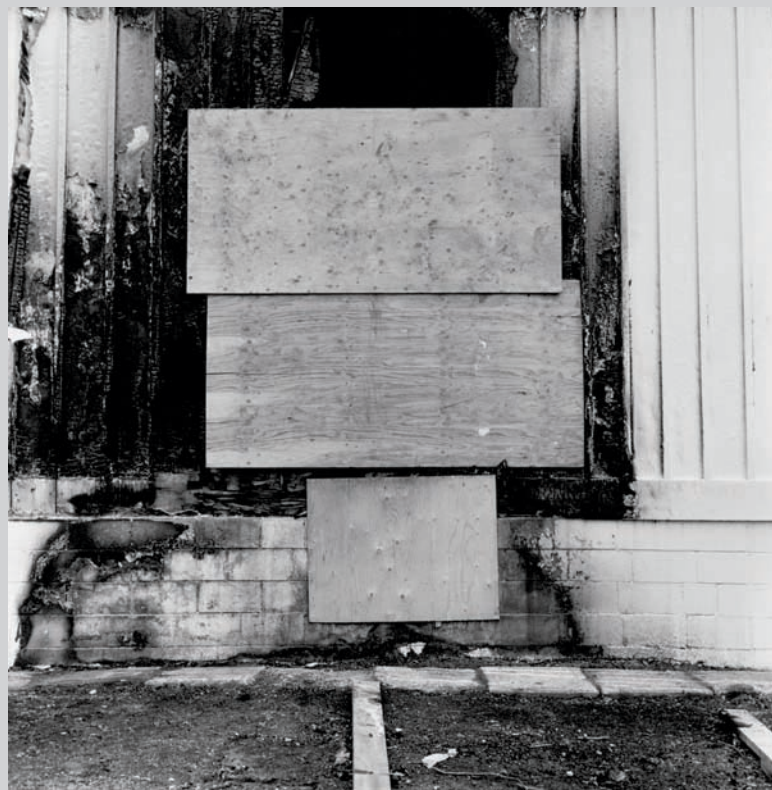
From the series Auto Mnemonic Six Nations , 2007, toned silver print, 76 x 76 cm

Les personnages représentés sont sa belle-mère, un ami, son fils. Ils fixent l'objectif, le regard dur et l'air distant. Plus qu'en peinture, il semble que le regard direct dans l'objectif soit très perturbant, probablement parce que plus vivant. Il y a également des personnages qui nous semblent moins statiques, qui bougent, comme cette femme qui se prépare pour