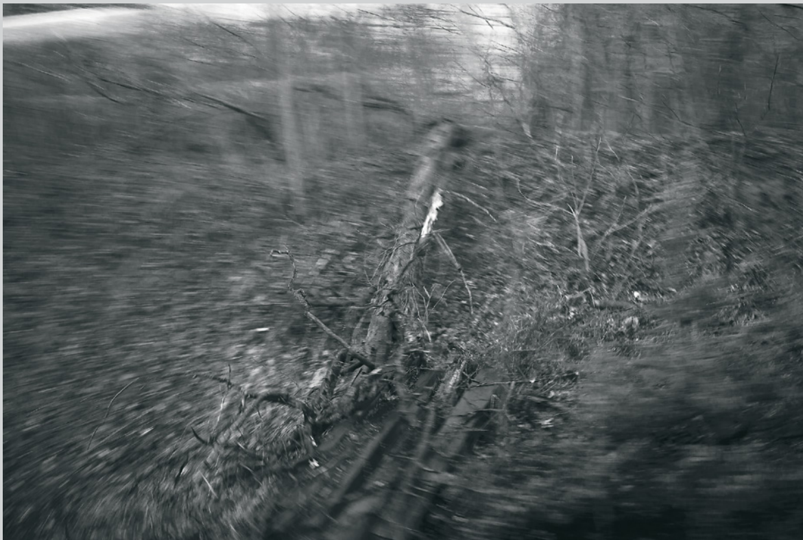
Untitled Photographic Pictures , 2015 inkjet print, 152 × 229 cm

and making it strange. Each photograph is a direct-from-camera snapshot taken through the window of a moving train. As he passes by the landscape, Wright makes a deliberate jerking motion with the camera that causes the otherwise clear, focused image to be interrupted. This destabilizing movement leaves the viewer continually distanced from the “original” landscape. Within the confines of the gallery space, these visual disturbances, or “knots,” are immediately apparent to the viewer; yet, the images, captured in a moment between documentation and abstraction, are not clearly revealed. At first glance – without consulting the exhibition text, for example – one might assume that the artist has digitally edited these images to arrive at an ideal formal state. However, the critical viewer will not read these photographs simply as either completely “untouched” or “altered,” but will consider the ways in which the photographic impulse itself is always already held in a tension between composition and incident. The queerness of Wright’s arrival of the image is related to his broader interest in shifting the conversation away from representation or iconographic content and toward process itself.