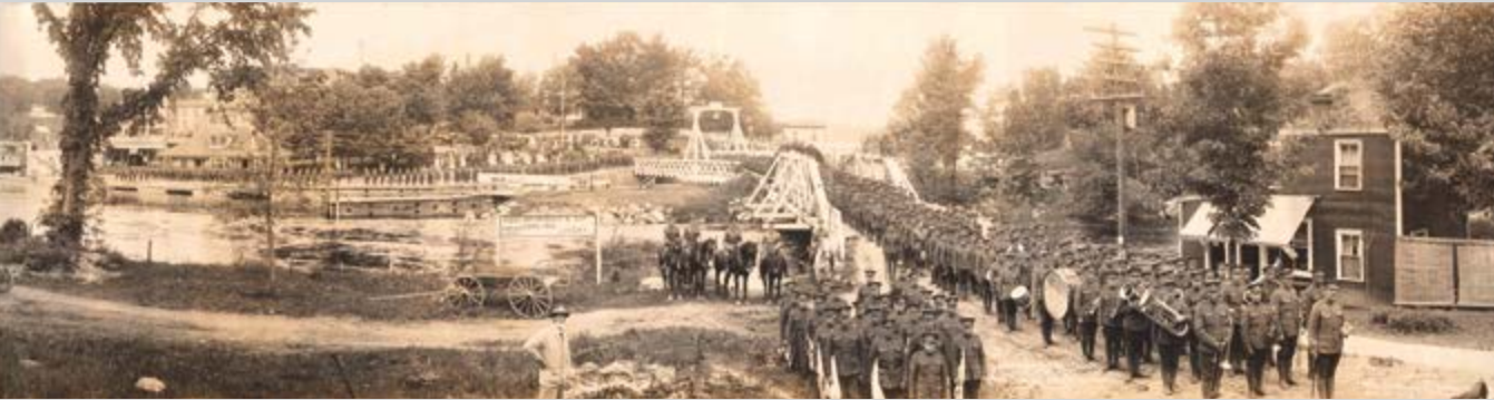
Panoramic Camera Company, 122nd Overseas Battalion, C.E.F. – Port Carling, Muskoka, Ontario, 1914–18, gelatin silver print, 24 x 90 cm