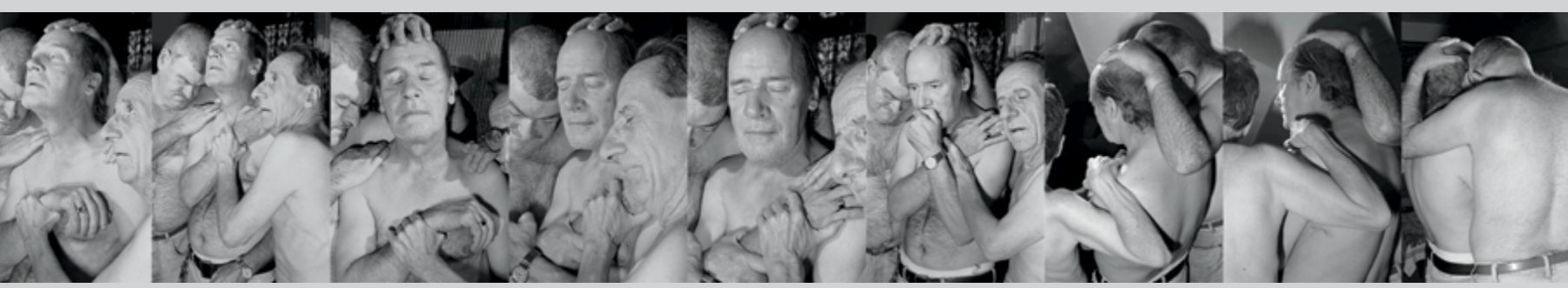
Donigan Cumming , Les Pleureurs, 1994, 9 vintage gelatin silver prints, 56 \times 38 cm each

same men – Albert, Geoff, and Gerry – they register a dark, transgressive power: the power of images to inflect and change the condition of being here – of being in the world. The men in question are all now dead. Cumming's is an art of resurrection and memorialization. The flesh crackles and sizzles with a fire that resists being extinguished even when all the oxygen