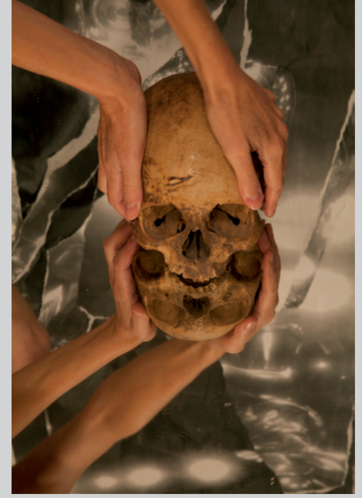
Andrea Szilasi, Mirror Skull, 2015, digital print, 155 \times 106 cm