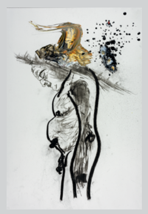
Donigan Cumming, Gerry no. 3, 2018, charcoal, pigment liner, acrylic, ink, 36\times24~\text{cm}

Such is the clarity of this work that it never runs the risk of devolving into