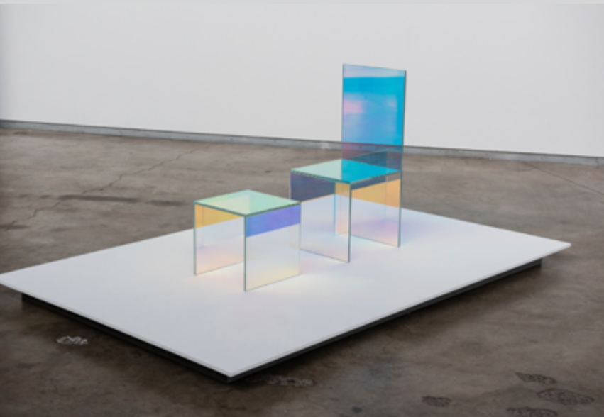
Dichroic Chair & Table, 2020