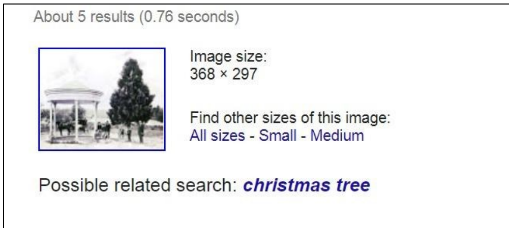
Figure 2 Screenshot of Google images result with multiple sizes.

Then each image was searched using the Google Chrome browser “Search by image” function. When available, the option to search Google for “all sizes” of the image, as opposed to just those