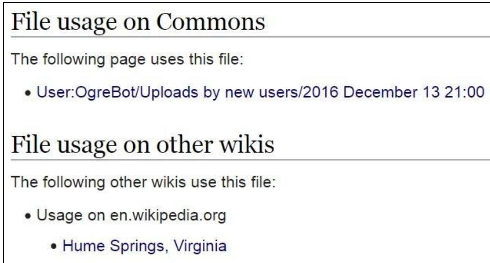
Figure 1 Screenshot of Wikimedia Commons file usage for “Hume Spring (c.1900) owned by Frank Hume (pictured far right).jpg” ( https://commons.wikimedia.org/wiki/File:Hume_Spring_(c.1900)_owned_by_Frank_Hume_(pictured_far_right).jpg ).