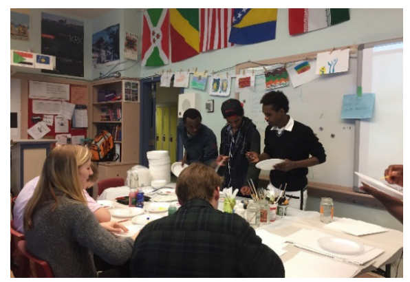
Figure 1. Students instruct printmaking using Styrofoam plates

Privileging collaborative approaches with non-academic groups, CBP approaches are often project-based in community locations and strive to address an existing challenge or problem (Leavy, 2017). Because such work can involve an experimental approach to navigation,