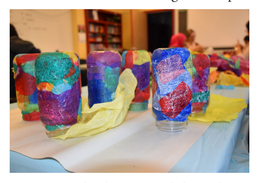
Figure 3. Glass lanterns made by students

The second series of eight weekly Art Hive sessions were conducted in the fall of 2017, revisiting our original framework and consulting with the youth about desired modifications. The participants suggested expanding the Hive sessions to invite local friends from within the school who