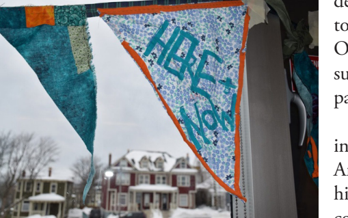
Figure 2. Cloth flags hang in the classroom

CBP research calls for necessary flexibility along the way, allowing for modification if required. Such flexibility fosters the inherently cooperative nature of participatory design and input and strengthens rigour and continuity due to its multi-perspective positioning. In our case, we took an arts-informed approach to our design by privileging art-making as the core activity. Most importantly, collaborating with a non-native-English-speaking newcomer population