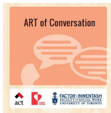
Figure 3. ART of Conversation

This last example is a pilot randomized, controlled trial (RCT) to address HAND through group therapy (Eaton et al., 2019b). The team from the HAND & social work study expanded to build off the findings and design an intervention study. I identified potential intervention models through key informant interviews with six HAND researchers. A peer researcher and I then held two focus groups with ten people aging with HIV, as well as eight social workers. These consultations finalized trial components including intervention selection, appropriate