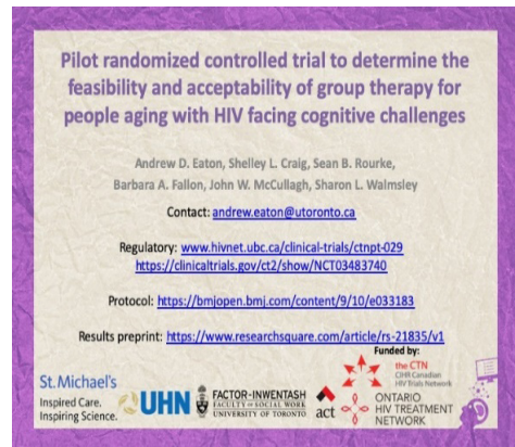
Figure 4. HAND Randomized, controlled trial (RCT)

These projects are part of my overall program of research to develop community-based interventions to address the complexities of living and aging with HIV. As illustrated in Figure 5, I attempt to mitigate such complexities (hospital discharge, cognitive health, and intimate relationships) through the interventions described above. To advance my research program, I assess these studies' results, consider how to adapt, scale, and implement these interventions, and evaluate community engagement. This paper represents a bird's eye view of that community engagement evaluation, where I consider my research program's strengths and limitations, and how my lessons learned can influence the culture of CBPR researchers and investigators considering the use of community engagement techniques in their investigations.