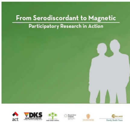
Figure 1. Magnetic Couples study

A modified narrative approach was used to describe four CBPR studies that I completed between 2014 and 2019 (Moen, 2006). I focused on cataloguing the strengths and limitations of community engagement as I reviewed my past projects and synthesized the findings against CBPR framework criteria to provide reflection for CBPR researchers as a society with evolving culture and practices. This section details each of the four studies. Community engagement strengths and limitations are synthesized in the following section.