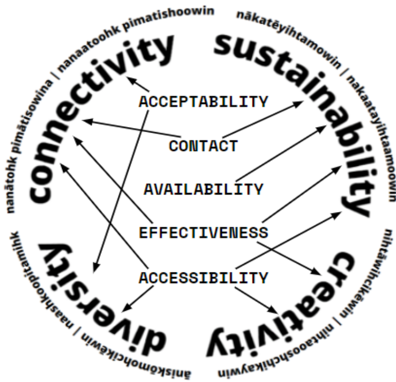
Figure 2: The Deep-Rooted Principles as Mutually Constituting

development goals to build a meaningful principles-based budgeting framework. As just one example, the sciences are more frequently building costs to natural environments into budgeting frameworks.