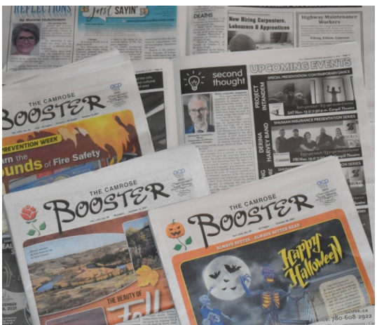
Copies of The Camrose Booster, a local newspaper in Camrose, Alberta.