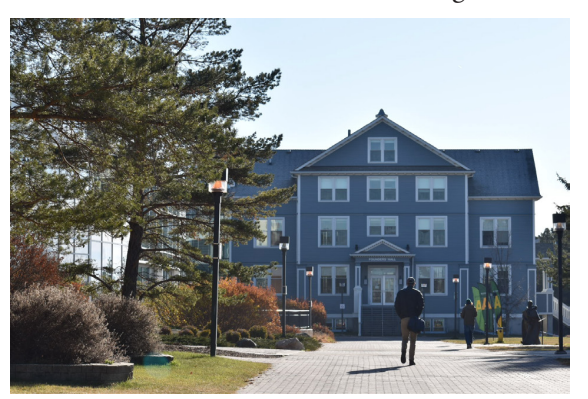
Founder's Hall, Augustana Campus of the University of Alberta, Camrose Alberta.