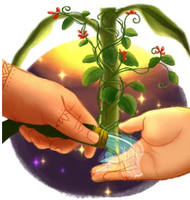
Figure 2. Compassion (Antone, 2021, September 1)

nurtured to engage more deeply through dialogue and critical reflection. It is a time to ask questions of self and others, to explore, and to engage in a shared community experience of learning. In the final stage, sharing (Module 4), students engage in praxis, bringing theories and practices of decolonization together through action. Students learn to participate in activism, using their learning to inspire the transformation of colonial structures, particularly as relevant to the white/settler logic that structures the professions of social work and public health. This last stage is not the end of the seed story, however, as the seeds (i.e., learning) themselves are a life force and in sharing them the story continues