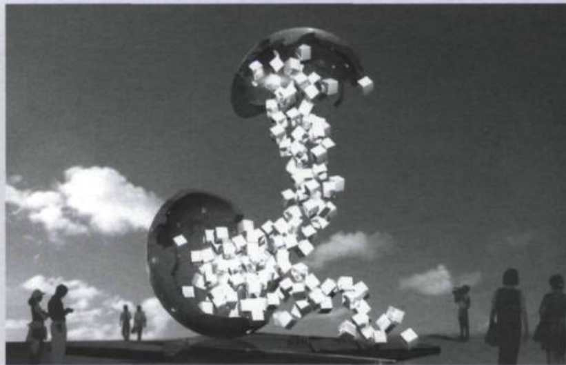
Shanghai. Pudong is a sub-region of Shanghai. The quest for transparency continues, and may yet be obtained by the layered selection process.