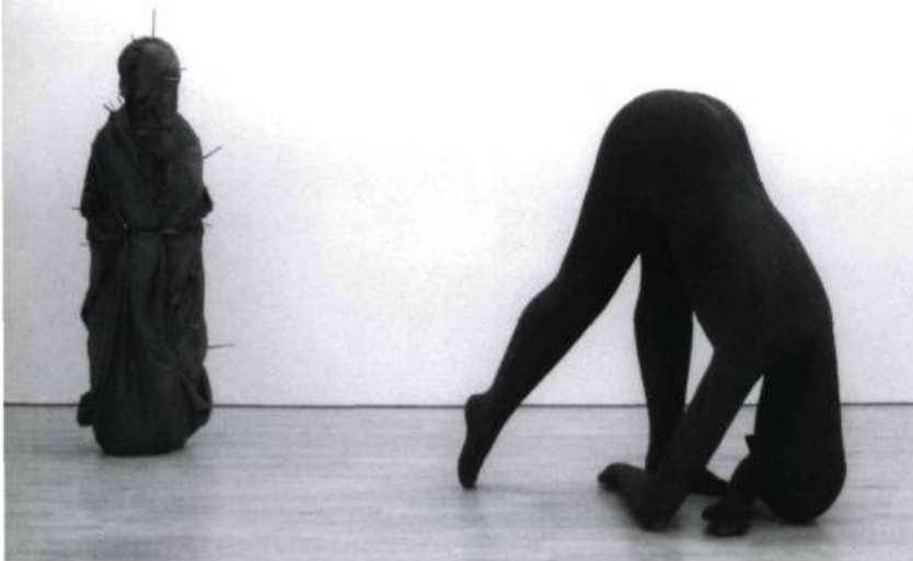
visage: un masque rehaussé de deux trous pour les yeux et d'une fente pour la bouche ( The man and the child , 1994).

En somme, il apparaît que chaque œuvre instaure un récit, que le sculpteur veille ensuite à déjouer, pour contrarier toute