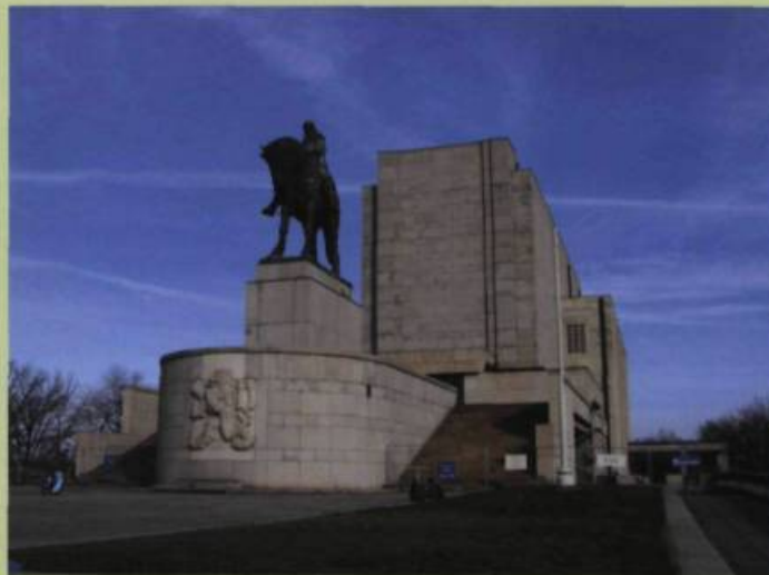
Bohumil KAFKA, Jan Zizka monument, ca. 1950. The statue itself is 9 meters high; height including pedestal is 22 meters. Prague.

Kafka's statue was ceremoniously erected on July 14, 1950 within a far different ideological context than that of its initial conception. Following their 1948 coup d'état, the communists commenced an Orwellian rewriting of Czech history. Stalin's party line was amenable to Zizka as a secularized symbol of Pan-Slavic