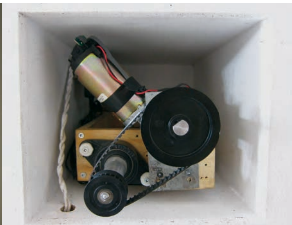
Ingrid BACHMANN, Pinocchio's Dilemma , 2007. Detail of the nose mechanism, cast resin, servo motors, arduino microcontrollers, metal, Plexiglas, plastic, wood, sensor.