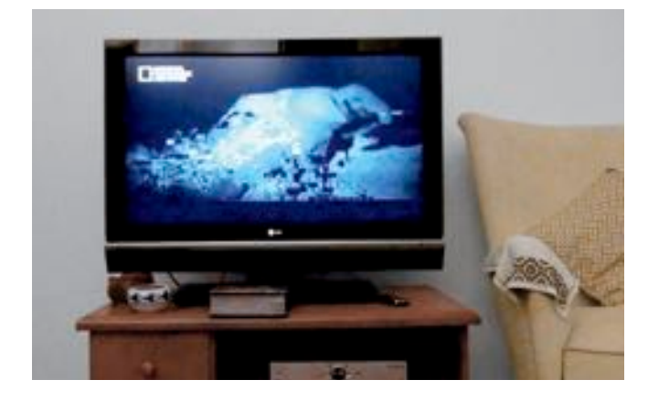
Basma Alsharif, Home Movies Gaza, 2013. Video (stills), colour, sound, 24 min.

viewer and previously unnoticed activity surfaces: leaves rustle on a branch, a solitary alarm system flashes above a manicured front garden, a fox yelps, clouds cover the moon above an unlit council block. The environment is alive, the camera is immersed and the artist, the human, has almost disappeared in an attempt, perhaps, to relinquish the subjective perspective.