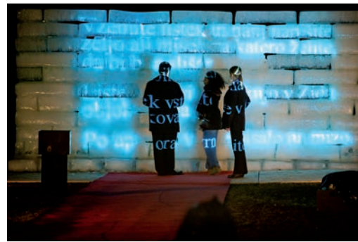
JANEZ JANŠA, THE WAITING WALL , NOVO MESTO, SLOVENIA, 2011.