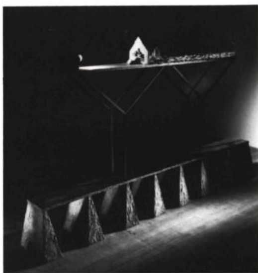
Denise Giguère, Tori , 1986. Wood, metal, ciment, plaster, stone, mylar, lighting system, miniature rails, paint, etc.; 365 x 150 x 22 cm.

The "contemplative quietude and tranquility" of Covit's three miniature cast-metal temple fragments reflected in a pool of water had a "dreamlike" quality (Covit) that transported the spectator to a moment in the irretrievable past while simultaneously evoking an awareness of the power of time to negate the present. The sculpture also accommodated the importance of the visible incurrance of nature on the ruin — the green patinaed and rounded edges of the bronze components alluding to weathered and lichen-encrusted stone.