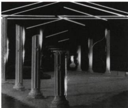
André Fournelle, Passage 2 e version , 1983. Mixed-média, 16 x 32 in.

Every image of the past that is not recognized by the present as one of its own concerns threatens to disappear irretrievably.