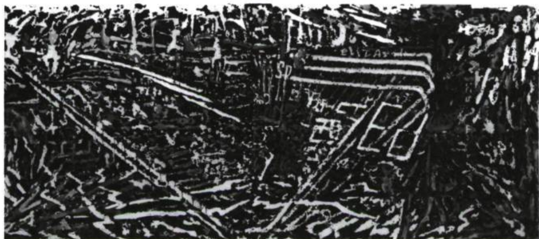
Marcel Saint-Pierre, New York Thruway '88: Broadway at 42nd Street, 1988. Acrylic film on canvas; 152.5 x 335 cm.

as mark and void, can be likened to the complex overlaying of musical riffs and grid-patterns of the urbanscape, respectively.