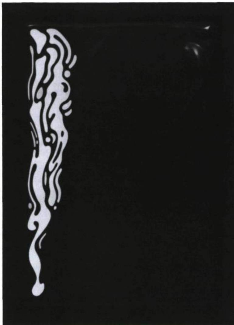
David Clarkson, Highlight Painting #5 , 1990. Lake and paint ; 91,45 cm x 61 cm.