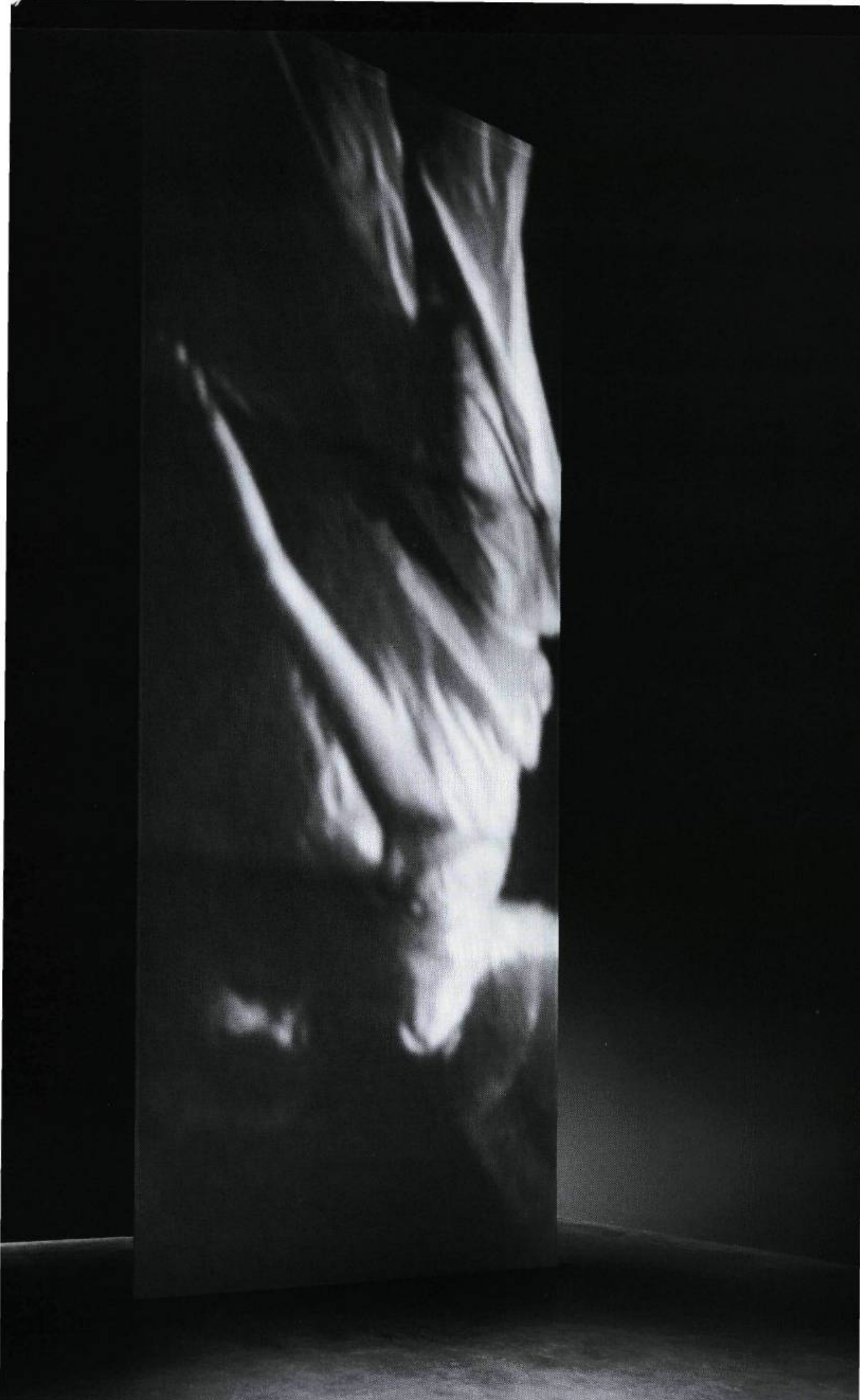
Bill Viola, The Arc of Ascent , 1992. Video/sound installation. Collection and courtesy : Ydessa Hendeles Art Foundation, Toronto.